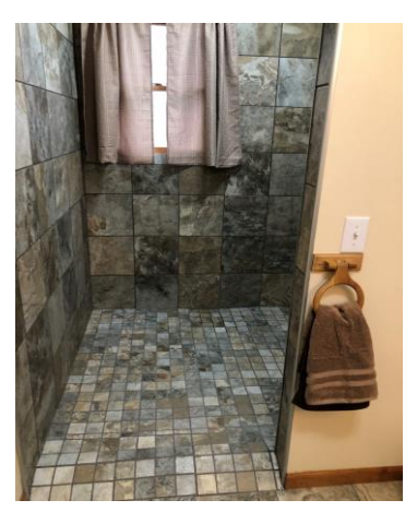
Jason's shower after the modification.