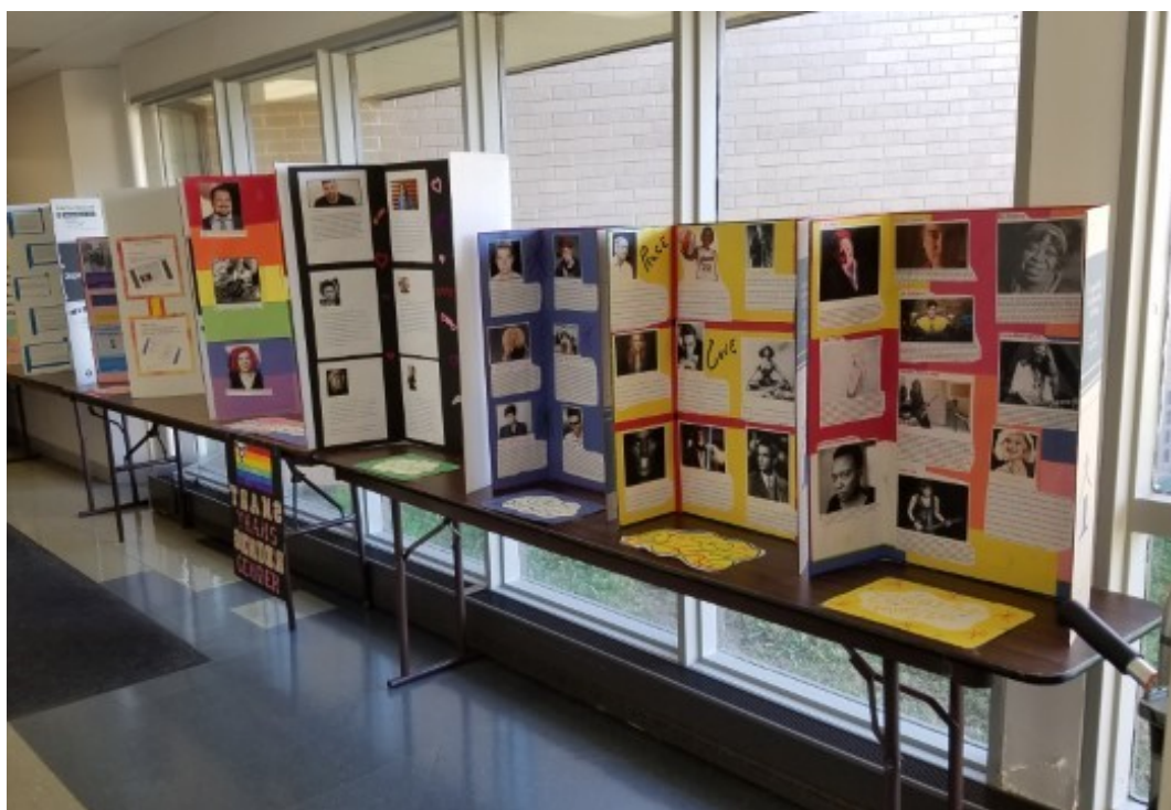
DART Educational Displays

Through discussion with the Internship Training Director, interns are able to decide the extent to which they want to be involved in the DART committee (i.e. developing new initiatives, collecting data, or simply regularly attending meetings). If there is a diversity project that is of greater interest, with approval from the ITC, interns may forgo attending the DART meetings in order to focus on this project and ultimately provide a presentation of their work at the end of the internship year.