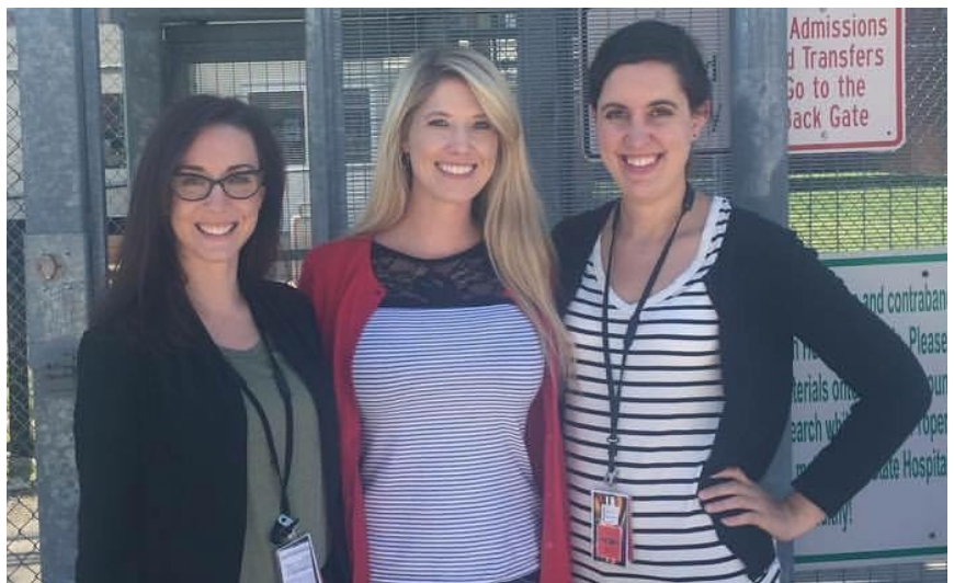
Intern Class of 2016-2017

The internship training program at FSH is devoted to meeting the interns needs and interests and looks forward to its role in training each cohort of successful interns.