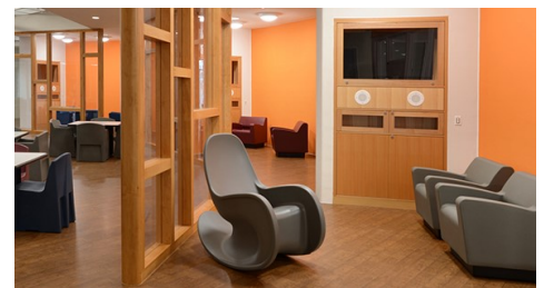
Nixon Forensic Center living area

Hearnese Forensic Center will be opening a 15-bed non-forensic acute stabilization living area. Individuals will be admitted from community residential providers or their homes of origin. These individuals will have well-established diagnoses of intellectual and/or developmental disabilities and will be experiencing acute psychiatric instability due to additional diagnoses of a serious mental illness such as a mood disorder, psychosis, or other behavioral challenges. These individuals will be provided with medication management and skills training to promote stabilization and return to the community. This program is intended to provide short-term treatment and length of stay will be 3-6 months. This will be the first program of its kind in the state of Missouri and will meet an important need for individuals who are inappropriately residing in jails or hospitals waiting for this type of treatment. At this time, the program is set to open in early 2024 once remodeling is completed.