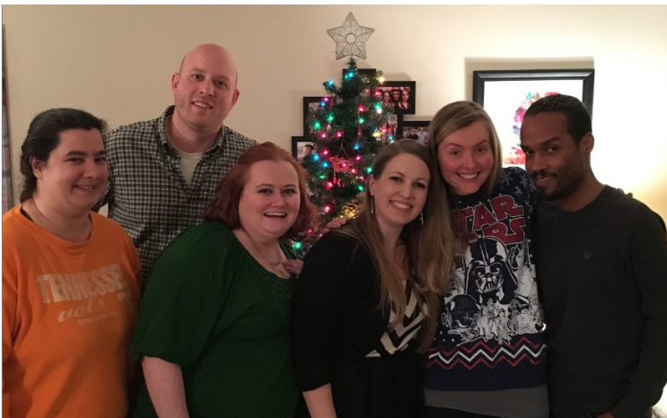
Postdoctoral Resident Class Holiday Party 2015

The Chicago School of Professional Psychology (2022) New Outlook Program