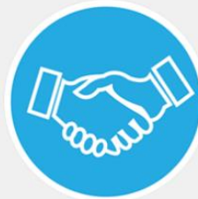
Personal Support Services