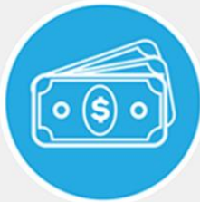
Basic Living Expenses